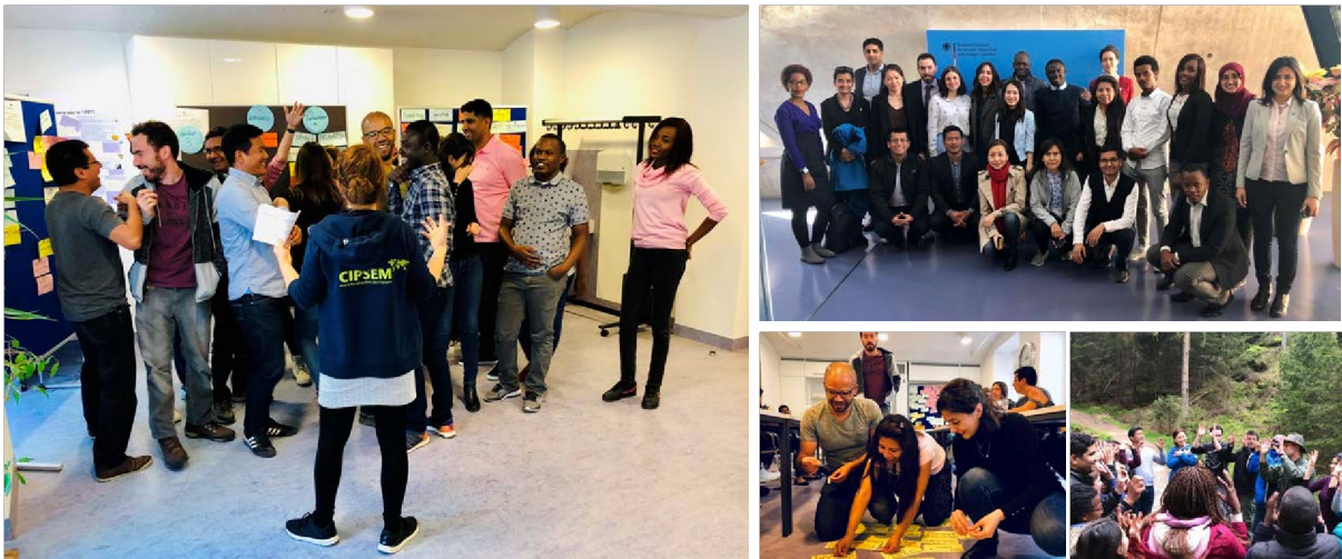
Fig. 2: Impressions from past trainings on environmental management