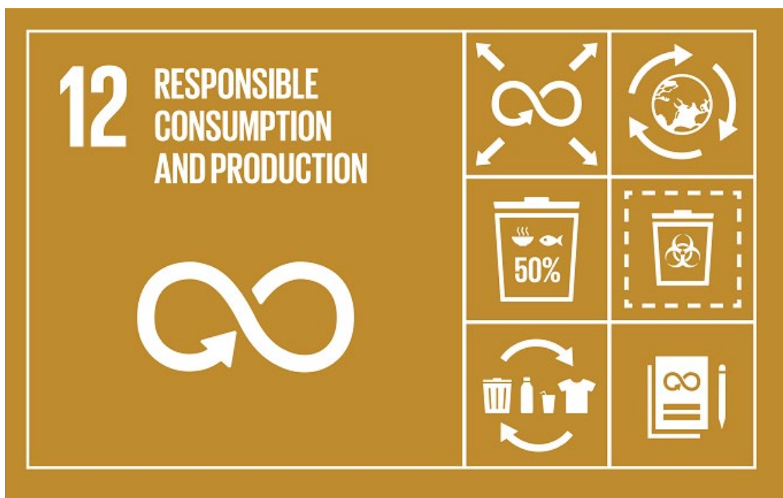
Figure 1: Sustainable Development Goal 12, titled "responsible consumption and production",

Sustainable consumption and production (SCP) aims at "doing more and better with less"- increasing net welfare gains from economic activities by reducing resource use, degradation, and pollution while improving the quality of life. SCP is essential to achieving a sustainable land use transition in line with the SDGs, the goals of the Paris Agreement and the Convention on Biological Diversity, as it promotes resource and energy efficiency, sustainable infrastructure, and access to essential services. Its implementation helps achieve overall development plans, reduce future economic, environmental and social costs, strengthen economic competitiveness and reduce poverty as dimensions of resilient and inclusive growth. SCP is essential to halting and reversing the loss of forests and biodiversity, and land degradation.