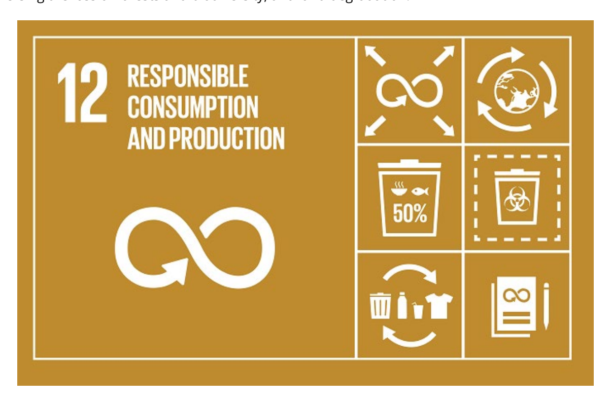
Figure 1: Sustainable Development Goal 12, titled "responsible consumption and production",

Sustainable consumption and production (SCP) aims at "doing more and better with less"- increasing net welfare gains from economic activities by reducing resource use, degradation, and pollution while improving the quality of life. SCP is essential to achieving a sustainable land use transition in line with the SDGs, the goals of the Paris Agreement and the Convention on Biological Diversity, as it promotes resource and energy efficiency, sustainable infrastructure, and access to essential services. Its implementation helps achieve overall development plans, reduce future economic, environmental and social costs, strengthen economic competitiveness and reduce poverty as dimensions of resilient and inclusive growth. SCP is essential to halting and reversing the loss of forests and biodiversity, and land degradation.